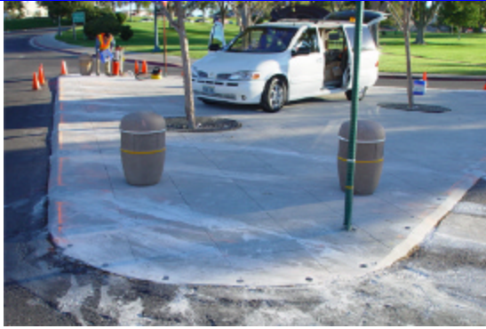
360° CURB MARKERS