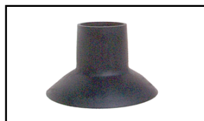
Suction cup base Item # VFSC-B