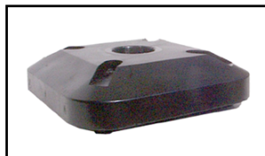
Road side base Item # VFRB-B