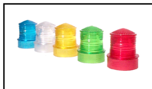
5 Colors choices Item # VPL-W