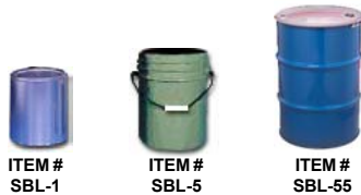
ITEM # SBL-1