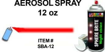
ITEM # SBA-12

Micro sphere technology with colored acrylic lacquer can be sprayed on virtually any smooth or porous surface for effective nighttime illumination. Instantly illuminate any surface with a light coat of spray mist. One (1) 12 ounce aerosol can covers approximately 18 square feet.