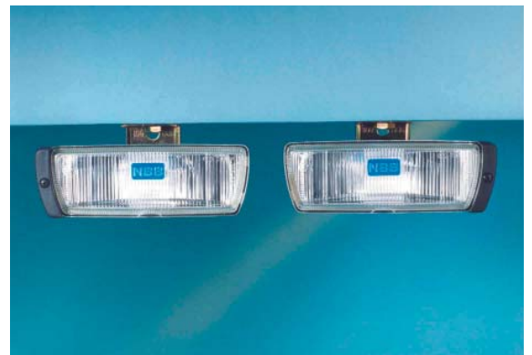
H- 4500 in pictures.