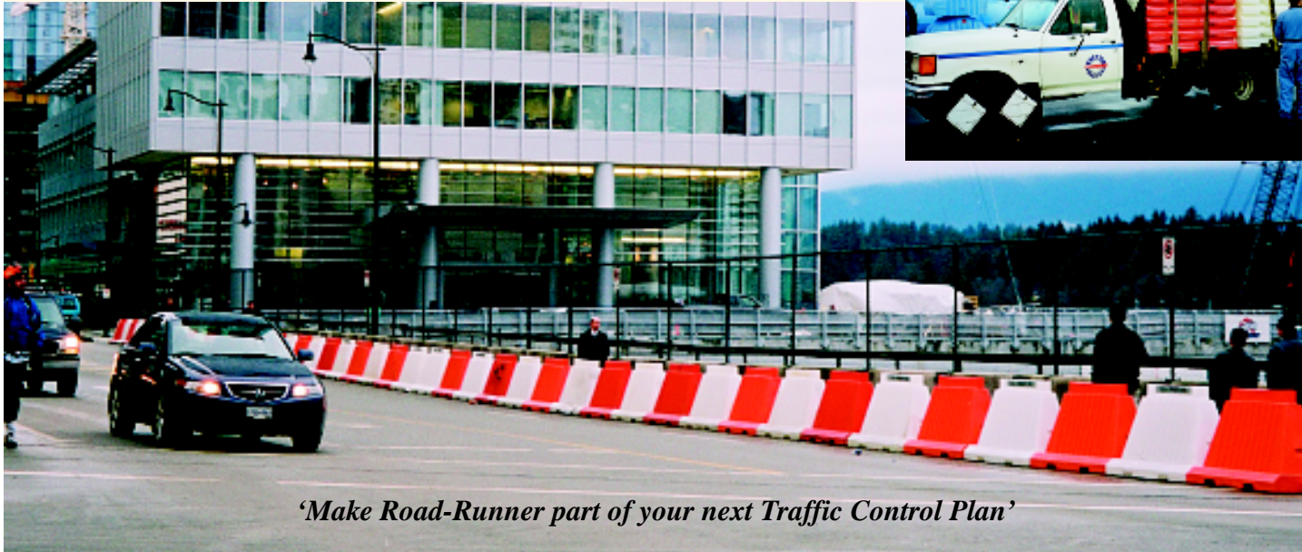
‘Make Road-Runner part of your next Traffic Control Plan’

Traffic Rerouting Temporary Road Closures Sidewalk Detours